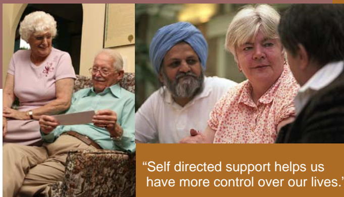
“Self directed support helps us have more control over our lives.”